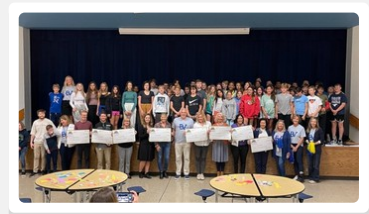
Students, Staff Recipients and Blue Valley Surprise Squad