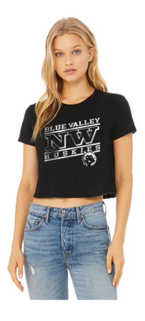
Parent Booster Club fundraiser is Feb. 3 - Save the date!

Save the date! Denim and Diamonds is back and you don't want to miss it! Hope you can join us and support our students and school. Go Huskies!